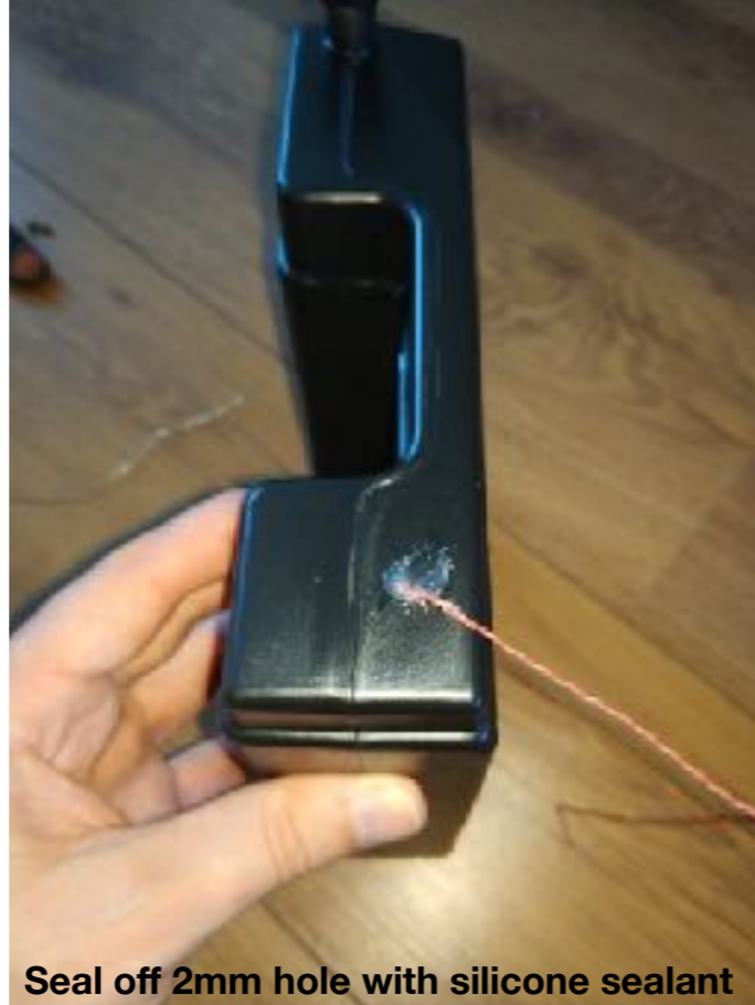
Seal off 2mm hole with silicone sealant