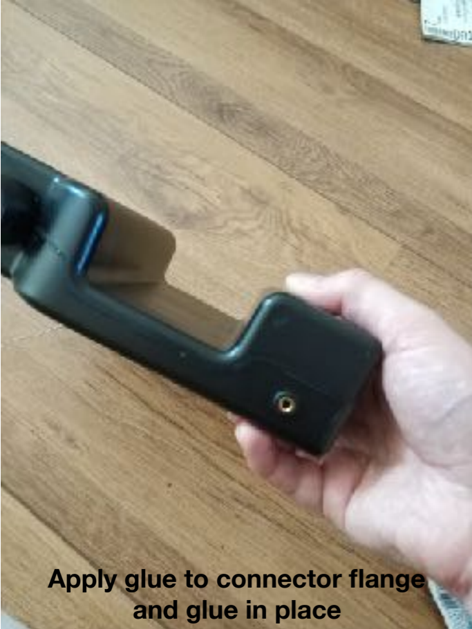
Apply glue to connector flange and glue in place